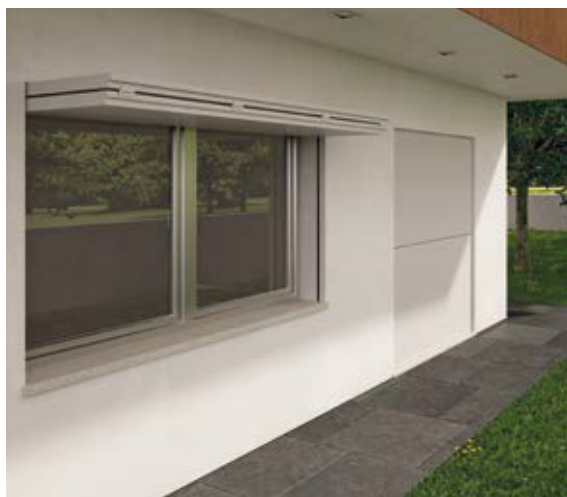
Completely coplanar panels when closed vertically; complete opening by horizontal panels.