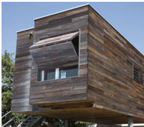
Wide range of colour and finish is available, thanks to its greatest capability to integrate into architecture